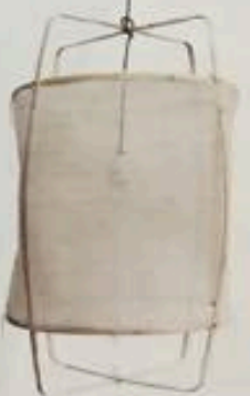
Ay Illuminate 'ZZZ' light shade made from bamboo and nettles $75 Spruce & Lyde