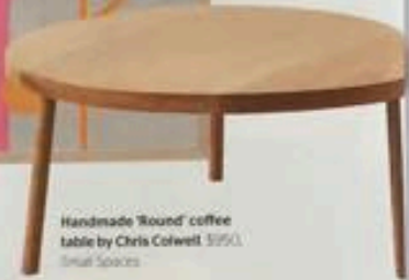
Handmade 'Round' coffee table by Chris Colwell $350 Small Spaces