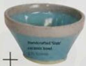
Handcrafted 'Uab' ceramic bowl $75 Kookala