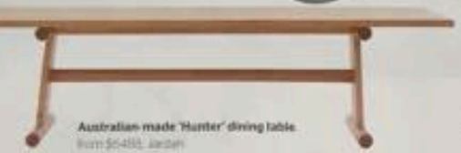
Australian-made 'Hunter' dining table from $6485 Jarden