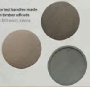
Assorted handles made from timber offcuts from $65 each, Inertia