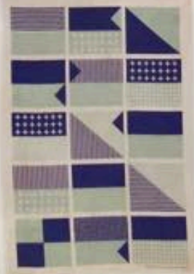
'Swim Between The Flags' hand-screenprinted tea towel $30 Everingham & Watson ADDRESS BOOK page 150