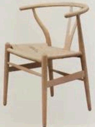
Vintage Carl Hansen & Son 'Wishbone' chair by Hans J Wegner $550/par Dansk Vintage