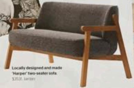
Locally designed and made 'Harper' two-seater sofa $3550 Jarden