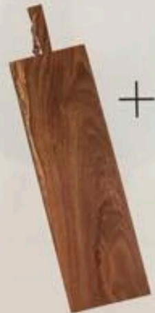
Recycled timber share platter $95 Kookala