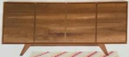
Australian-made Tasmanian oak 'Cassini' buffet $2799 Oz Design Furniture