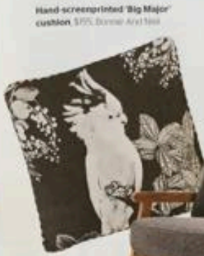
Hand-screenprinted 'Big Major' cushion $355